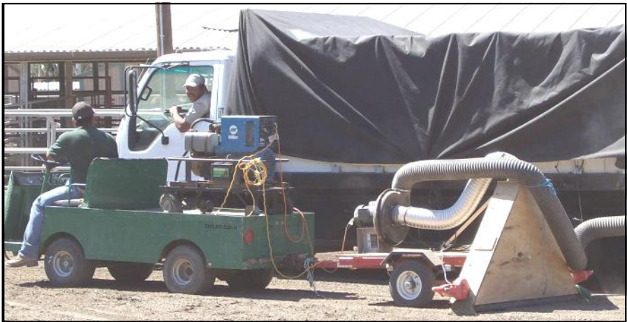
Shown here is the first run of the prototype arena vacuum. The black fabric on the truck was later replaced with a giant sealed dust bag to eliminate dust leakage.

Tesla, I had a spark of an idea. Why can't we do the same with the arenas? Now rather than dealing with all the footing under the sifting regime, instead let's just target the dust. The key must lie in dust's unique suspension property. Getting back to the sweeper truck, I initially thought; let's just buy a sweeper, drive it around the arena a few times and we'd be done for the week. (Maybe we can post a few no parking signs and a meter maid can drive ahead and cite those horses for being in the arena as an additional income source!) Anyways the bad thing is that these trucks' vacuums are so powerful that it would suck up everything. So this easy answer was out.